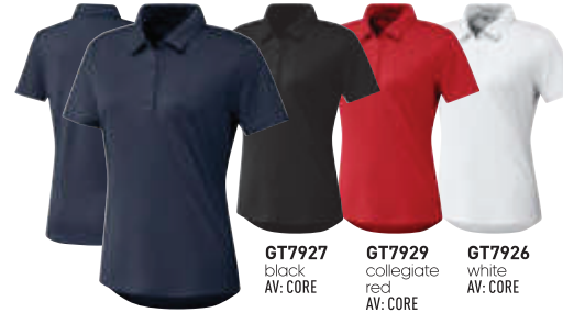
GT7928 collegiate navy AV: CORE