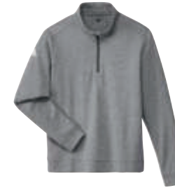
GQ2416 grey three mel