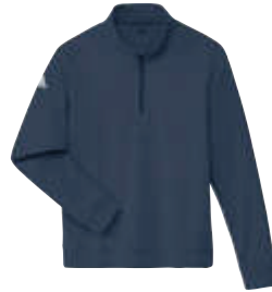
GU3928 crew navy