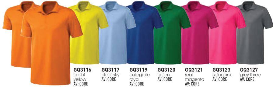
GQ3115 bright orange AV: CORE