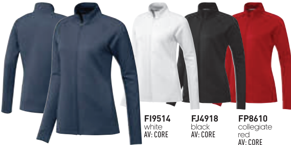
GL6550 crew navy AV: CORE