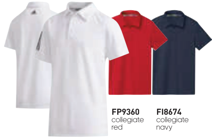
FP9360 collegiate red