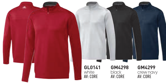
GM4127 red AV: CORE