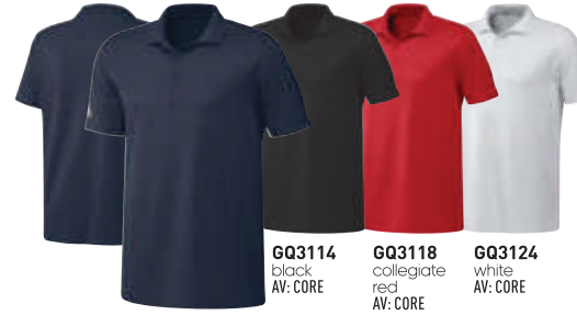
GQ3122 collegiate navy AV: CORE