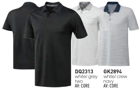
DQ2301 carbon/black AV: CORE