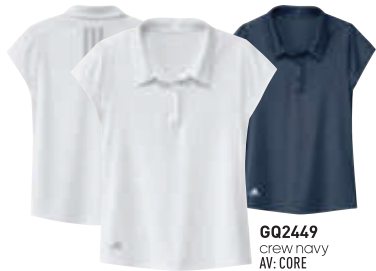
GQ2449 crew navy AV: CORE