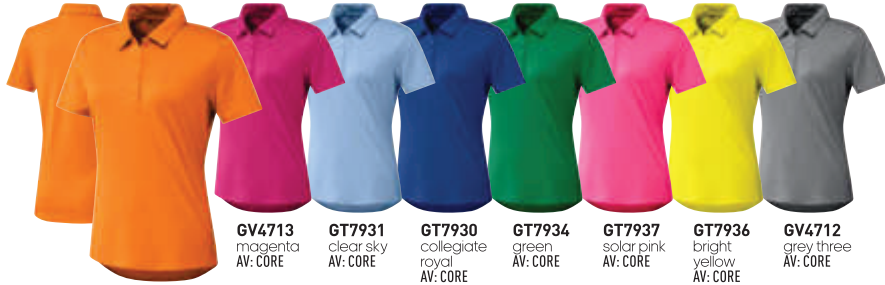
GT7932 bright orange AV: CORE